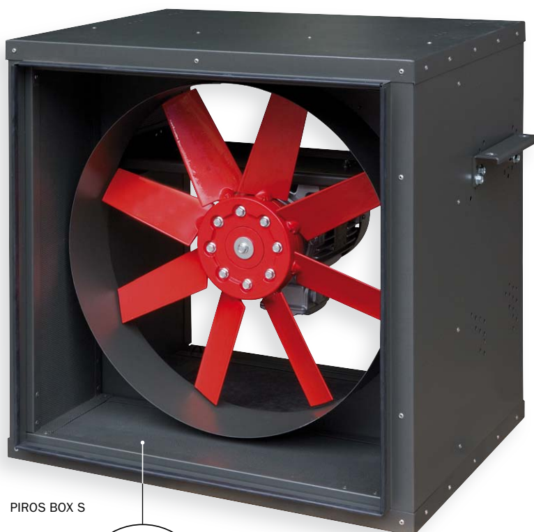
PIROS BOX S

Brandgas-Ventilatorbox, wärme- und schallisoliert